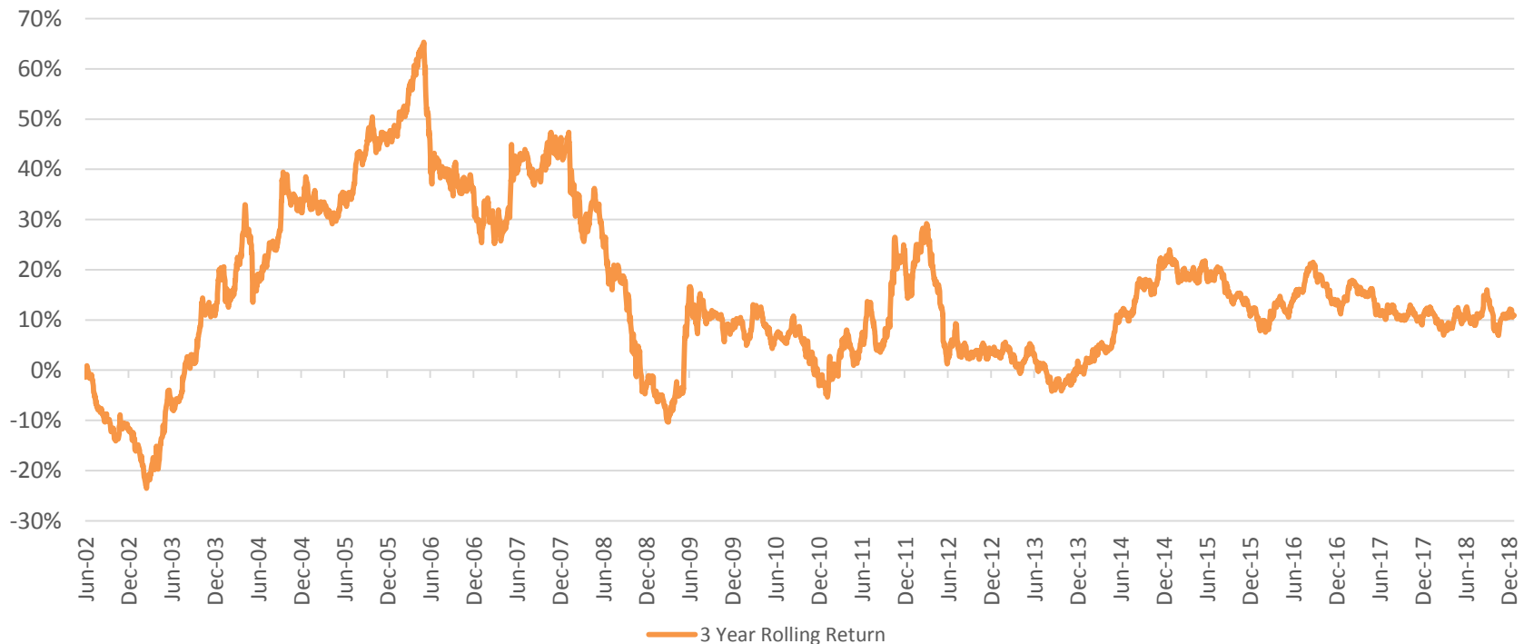
3 Year Rolling Return

Source: MOAMC internal analysis, Data as on December 31, 2018